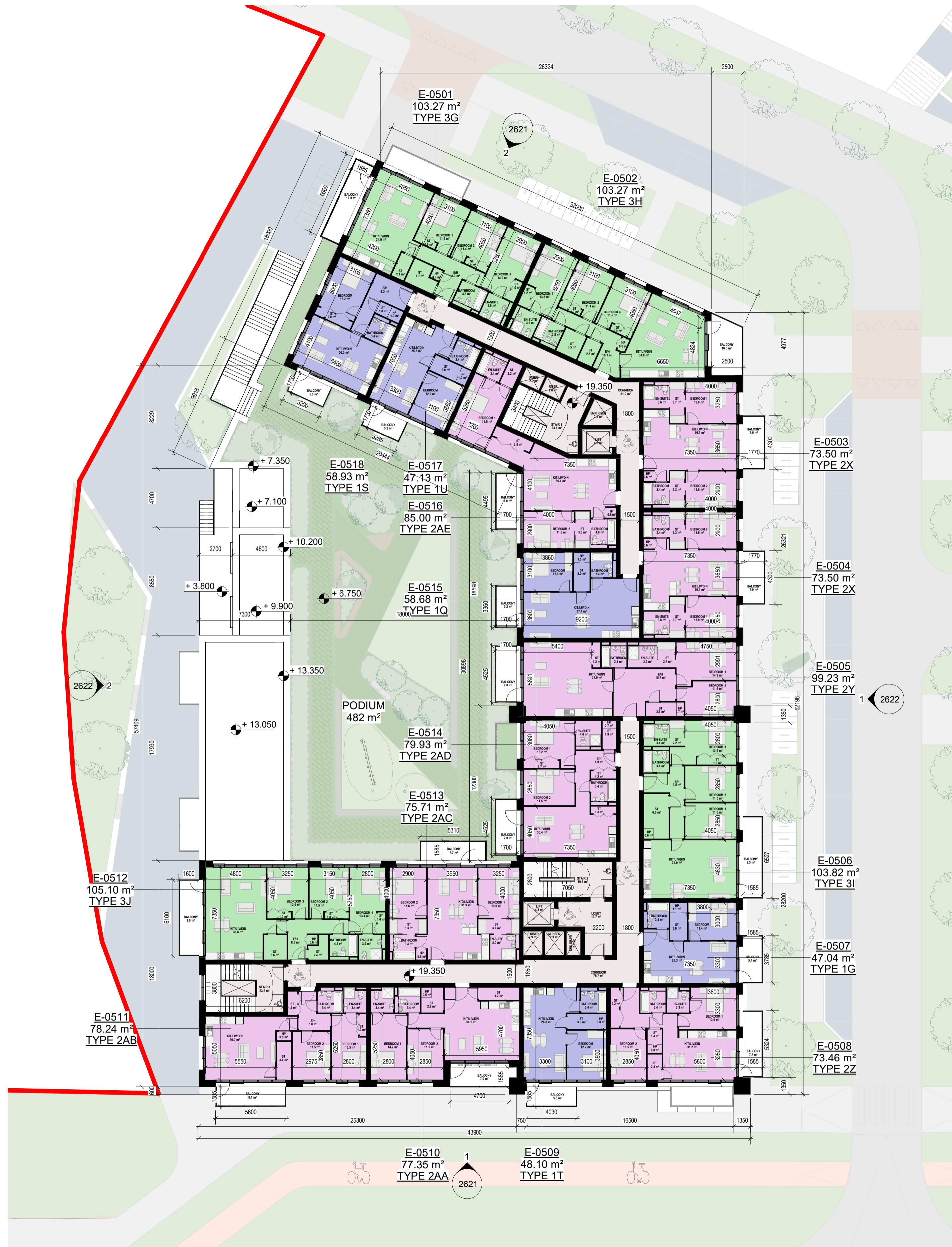
Accommodation Schedule-BLOCK E_L05

AREA TYPES 1 BED 2 BED 3 BED 3 BED - DUPLEX CIRCULATION